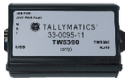
Serial to USB Bridge