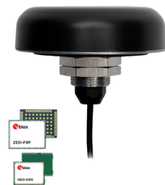
TW5394 Smart GNSS Antenna

The Calian TruPrecision SDK is a Windows application which provides an autonomous connection to stream RTK corrections and decryption keys to the TW5394 Smart Antenna via a USB Serial Bridge, which also provides a Virtual COM Port to allow customers to connect their existing applications to the Calian Smart GNSS Antenna high precision "corrected" position data output. The position data may be either NMEA or UBX formatted messages.